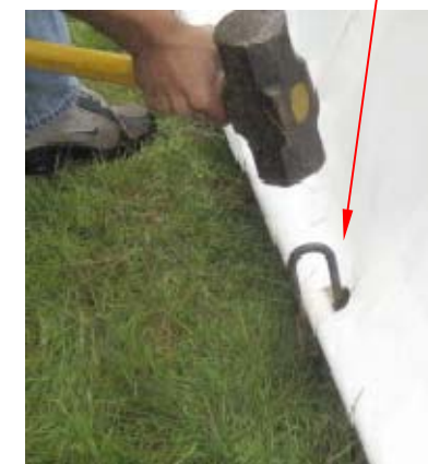
Staking hook stake to hold pvc tube which is inside wall pocket